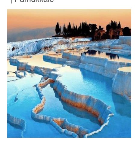
Day 5 I Pamukkale

Transfer from Pamukkaleto-Konya-Cappadocia.